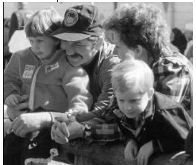
Building time for family activities is one important part of stepfamily development.