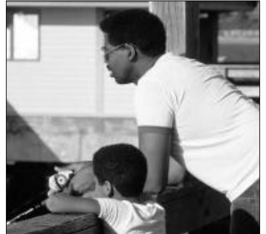
Divorce education programs reinforce the role of fathers in nurturing children.