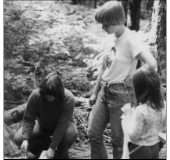
Family rituals such as annual camping trips are one way to put family life as a high priority.

If you are interested in a new social movement by parents to make family life a higher priority in our overscheduled, consumer-saturated world, look for information on the Family Life 1st project in Wayzata, Minnesota on the web at www.familylife1st.org , which will be on-line beginning in late June.