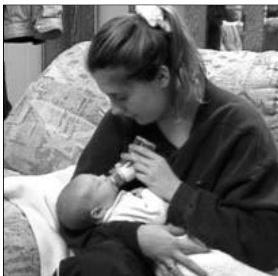
Home-visiting programs provide parents with critical information about feeding, bathing, communication and play.

The Harris ITV Seminars make ample use of videotapes of parent-infant interactions as a springboard for discussion and to illustrate ways that professionals can enhance their use of videotaping techniques. In one case presented at the seminar, a home visitor used the videotape to help a mother who was somewhat detached, observe how her child was attempting to connect with her in many positive ways. Within weeks of this session, the mother was more engaged and spending more time with her child.