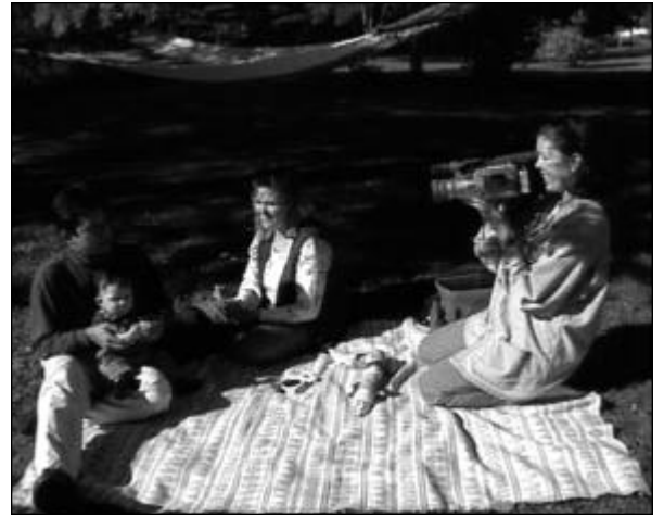
Videotaping parent-child interactions helps parents become sensitive to a baby's signals and needs.

Parents also use their bodies and voices to set the cadence of their interactions. By rocking and using a smooth and pleasant tone of voice, the parent creates an atmosphere of acceptance and knowing. Over time, parent and baby build a shared understanding and a lasting bond of predictability. The rhythm of their communication becomes the footwork of a well-rehearsed dance.