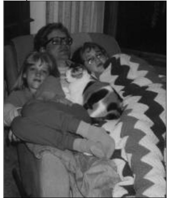
Sometimes the most important nurturing is simply cuddling together.

As a practitioner who uses research routinely as part of educational programming, my personal experience as a stepparent caught me up short. How well had I been validating the experiences of those I was teaching and integrating those experiences into the research base? Clearly, as blended families continue to emerge as a widespread family form, research and experience will need to be carefully balanced in order to effectively and authentically address the issues they face.