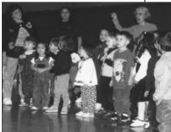
At Neighborhood House, kids and teachers practice songs in English and Spanish to prepare for Child Care Graduation.

When families and communities are directly involved in shaping parenting programs wonderful things happen. No place is this clearer than at Neighborhood House's School First program.